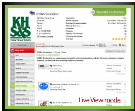
Live View mode

Call or Email: Noel Kornacki 812-305-7747 noel@jobsite123.com