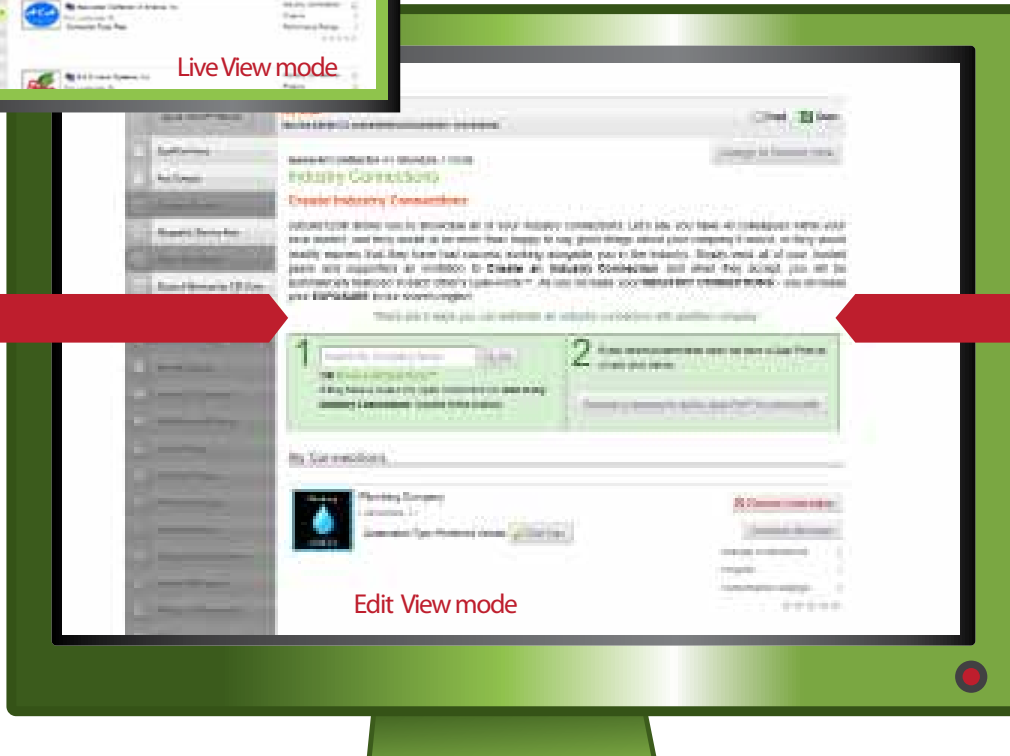
Edit View mode

Request to connect with companies that are already in jobsite123.